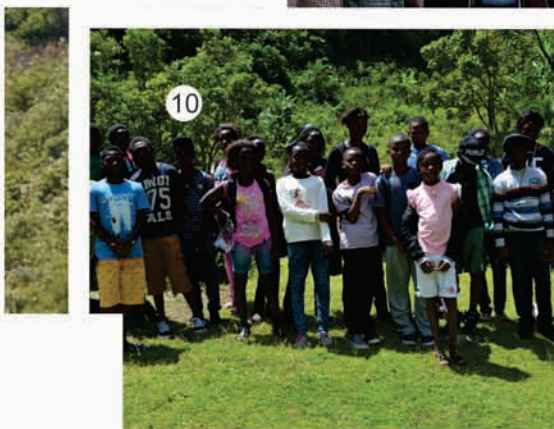
1-5: UK Trip 6-10: Cross River Trip 11- 15: South Africa Trip